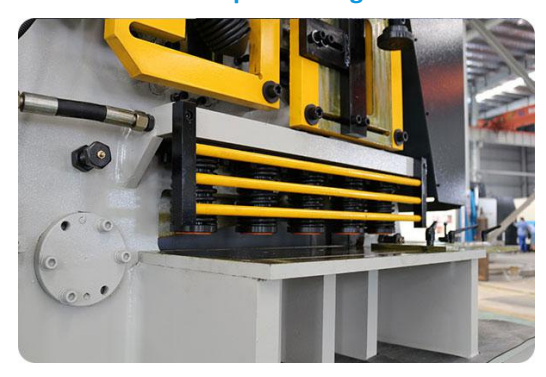
Shear plate automatic hydraulic clamping