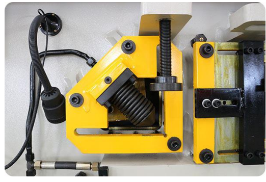
angle steel shear automatic clamping