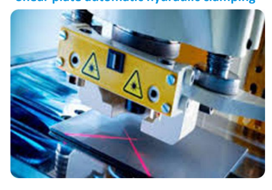
Infrared ray positioning ( Punching position )