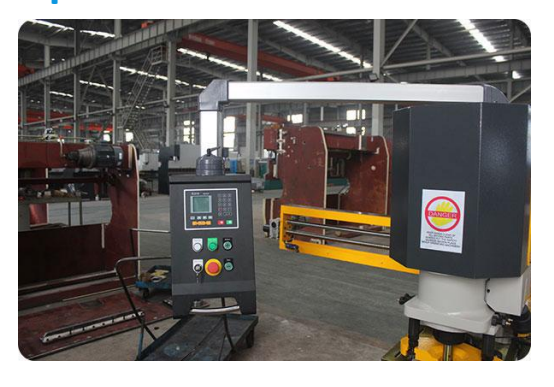
Angle steel, channel steel , round steel automatic positioning shear